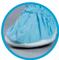
Sole Flat and Cavity